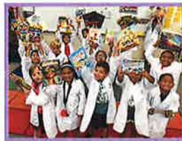
P.H. Miller Students

At all levels of instruction, Plano students are engaging in STEM activities.