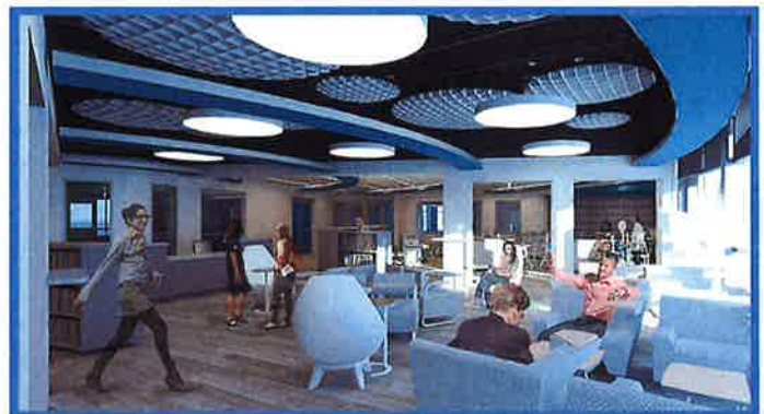
Rendering of New Innovation Center