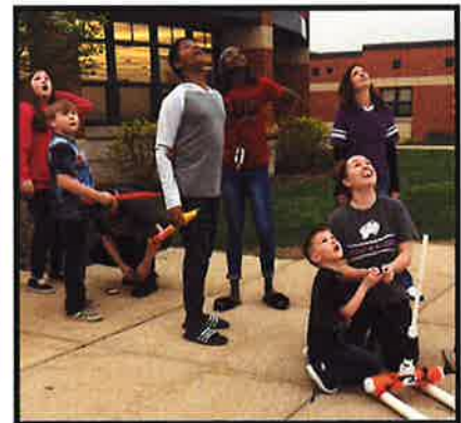
Students from Emily G. Johns School during their rocket launch.

Emily G. Johns School hosted a Math & Science Spectacular evening which featured an Inflatable Starlab Planetarium, 6th grade Math Fair Projects, 5th Grade Science Experiments, IMSA and an opportunity to make your own rocket.